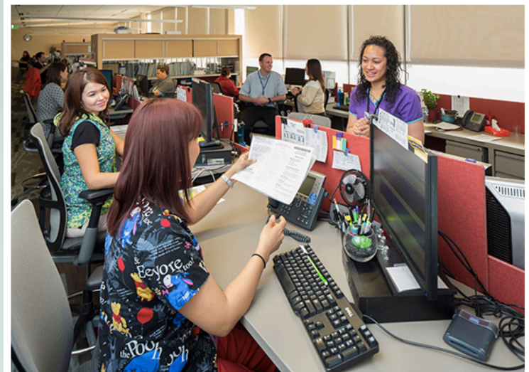
Integrated Care Team Work Space