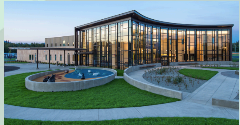
Benteh Nuutah Valley Native Primary Care Center