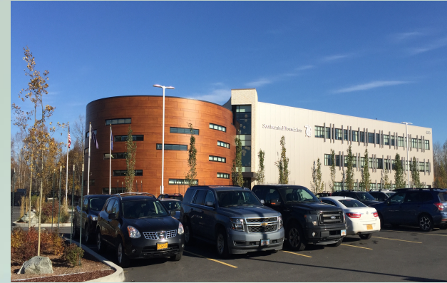
Nuka Wellness and Learning Center

SCF's "Nuka System of Care" is a health system: