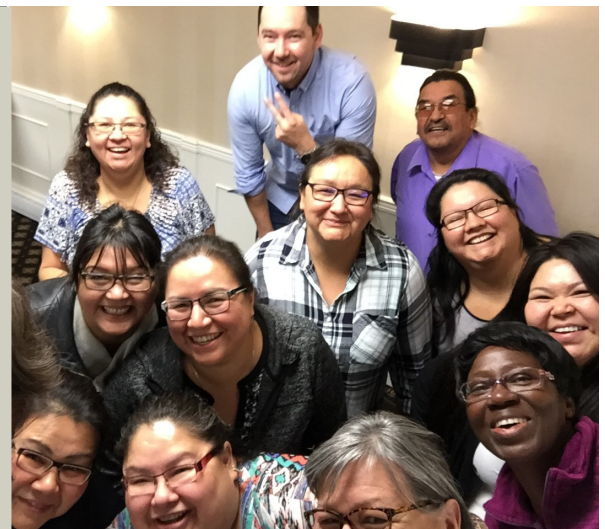
At the end of the Café, take a group selfie showing the main idea you discovered!