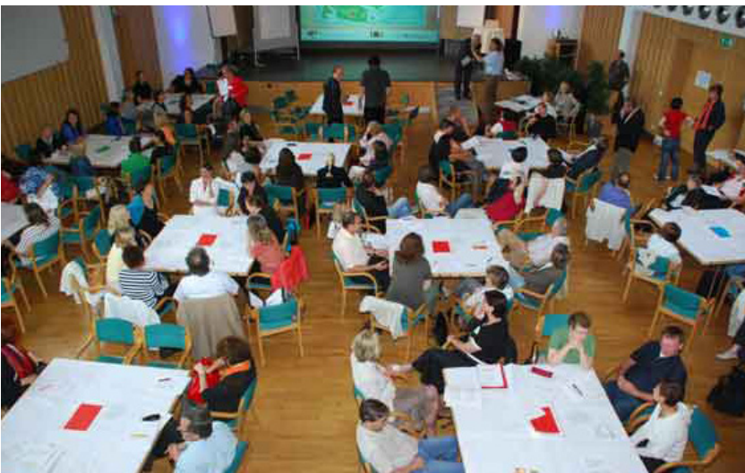
This is what the Maamuu Café will look like.