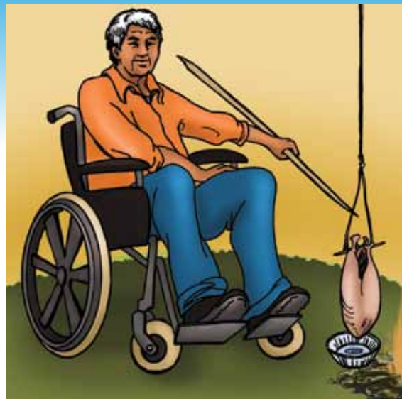
Take part in meaningful activities