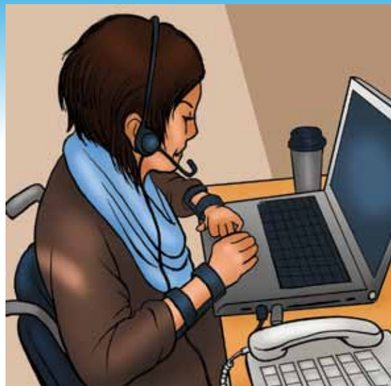
Get back to work