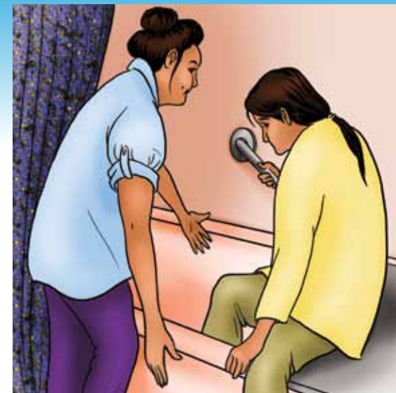
Take care of myself