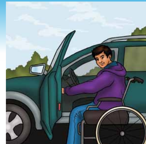
Be more independent